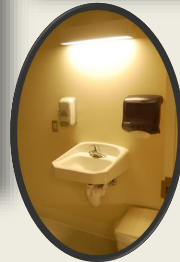
Hand wash station in each room