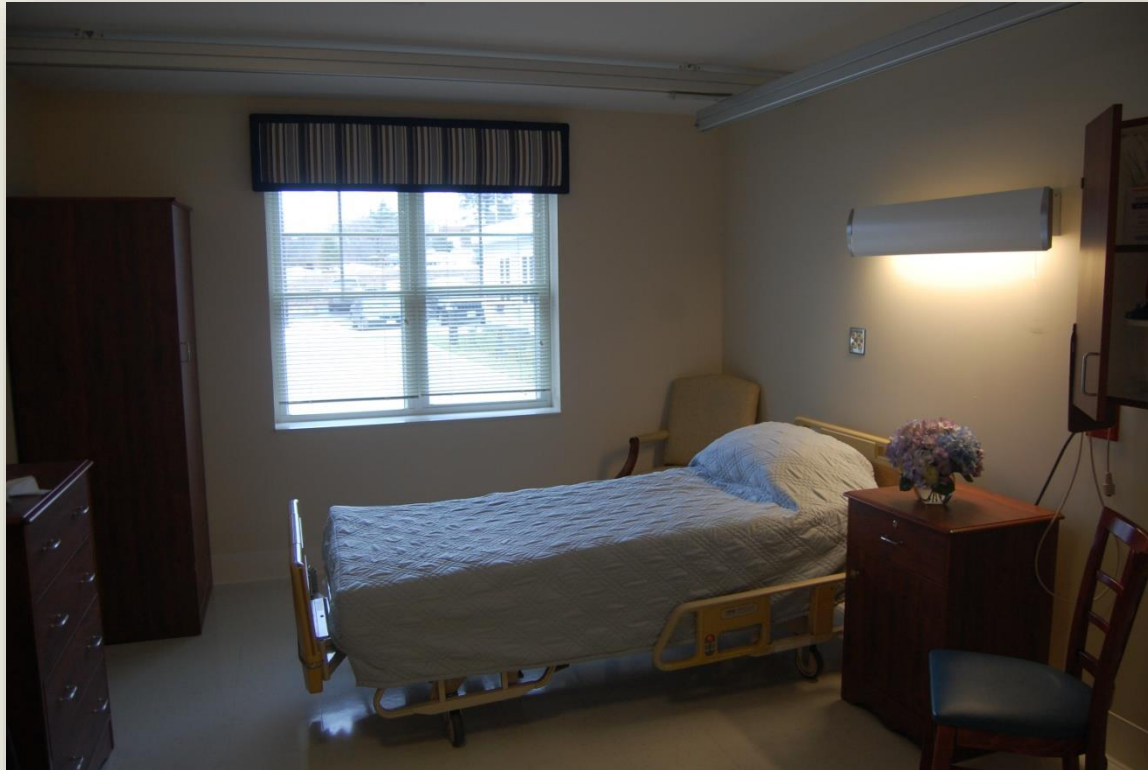
31 Spacious Private Rooms